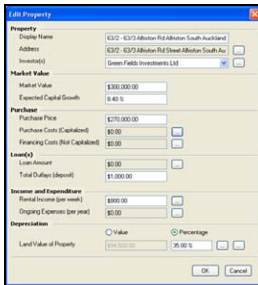
The Edit Property Panel