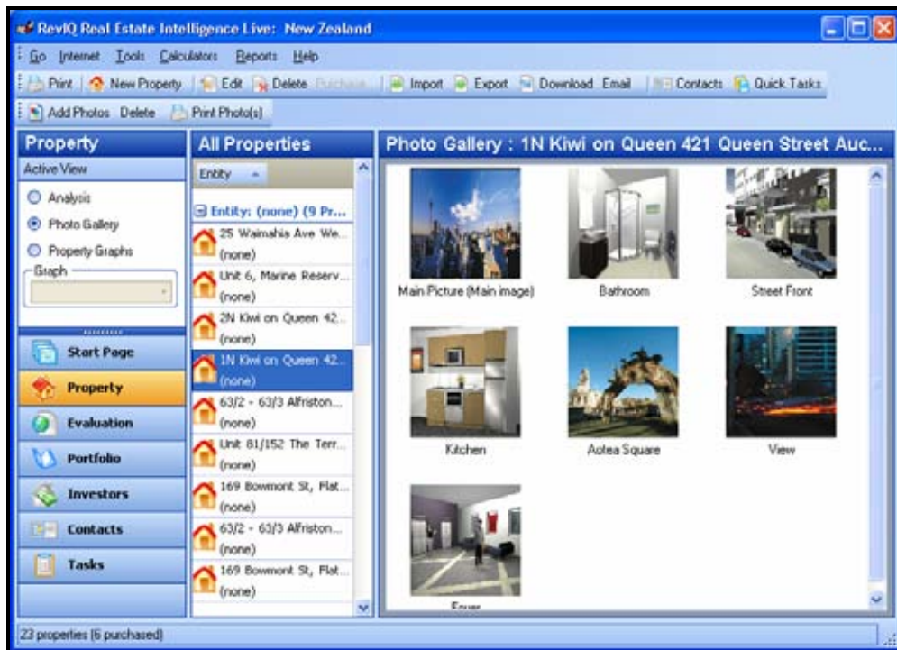
Property Module: Photo Gallery